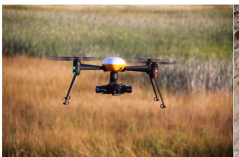
Draganflyer X4-ES UAS