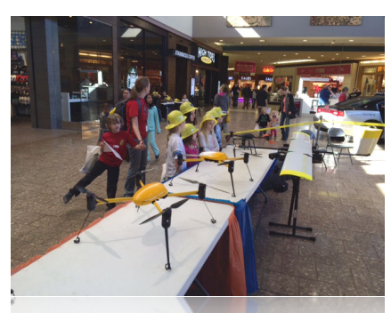
Mesa County Sheriff UAS on display at the Mesa County Safety Fair 2014

several years now we have been taking the systems to the annual "Mesa County Safety Fair". Our UAS team is on-hand to showcase the aircraft, answer questions and it provides an excellent opportunity for people to see the systems up close.